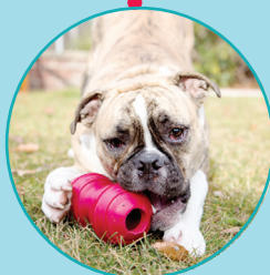
Dental Unique Denta-Ridges™ clean teeth while providing a chewing outlet