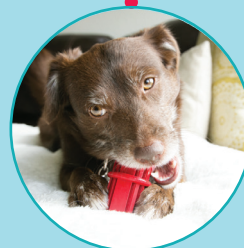
Dental Stick™ Stuff Denta-Ridges™ with treats; pastes or peanut butter to extend playtime