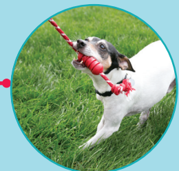
Dental with Rope Cotton rope cleans teeth while satisfying natural instincts